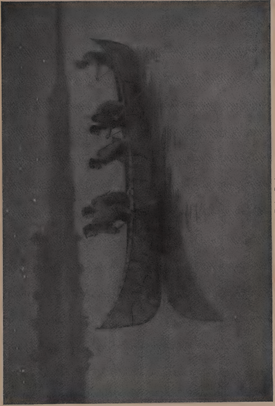
Drawn by Frederic Remington.